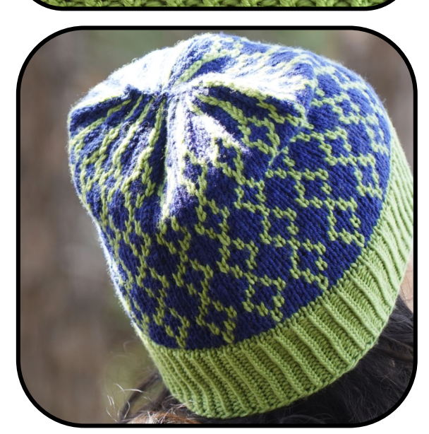
All images, text and illustration(s)<sup>©</sup> Cascade Yarns<sup>®</sup> 2019